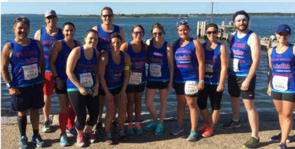
Our 2016 runners gathered for a photo and encouragement before going the distance.

May Institute's goal is to provide a highly motivating and supportive environment in which individuals with autism can improve developmental skills including physical fitness, gross motor, cognitive, and social/emotional skills.